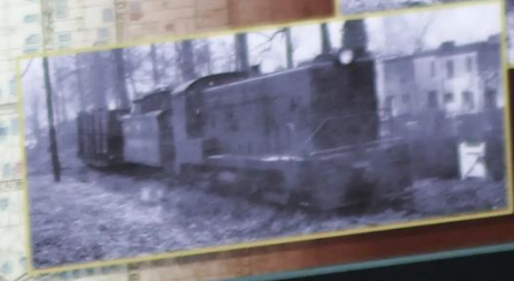
Two different types of trains at the same location twenty years apart: Above, a steam-powered Pennsylvania Railroad freight train in 1946. At left, a diesel locomotive and coal car handle a single freight car in 1952.